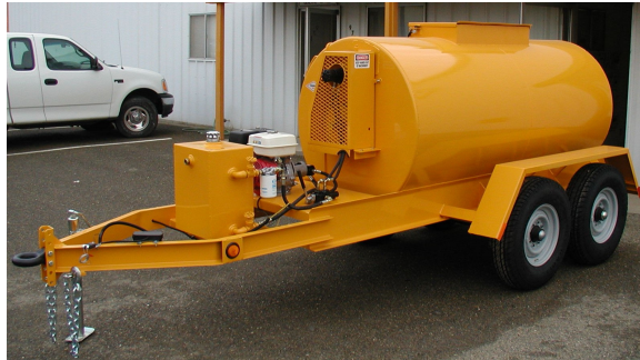
600 GAL. TRAILER